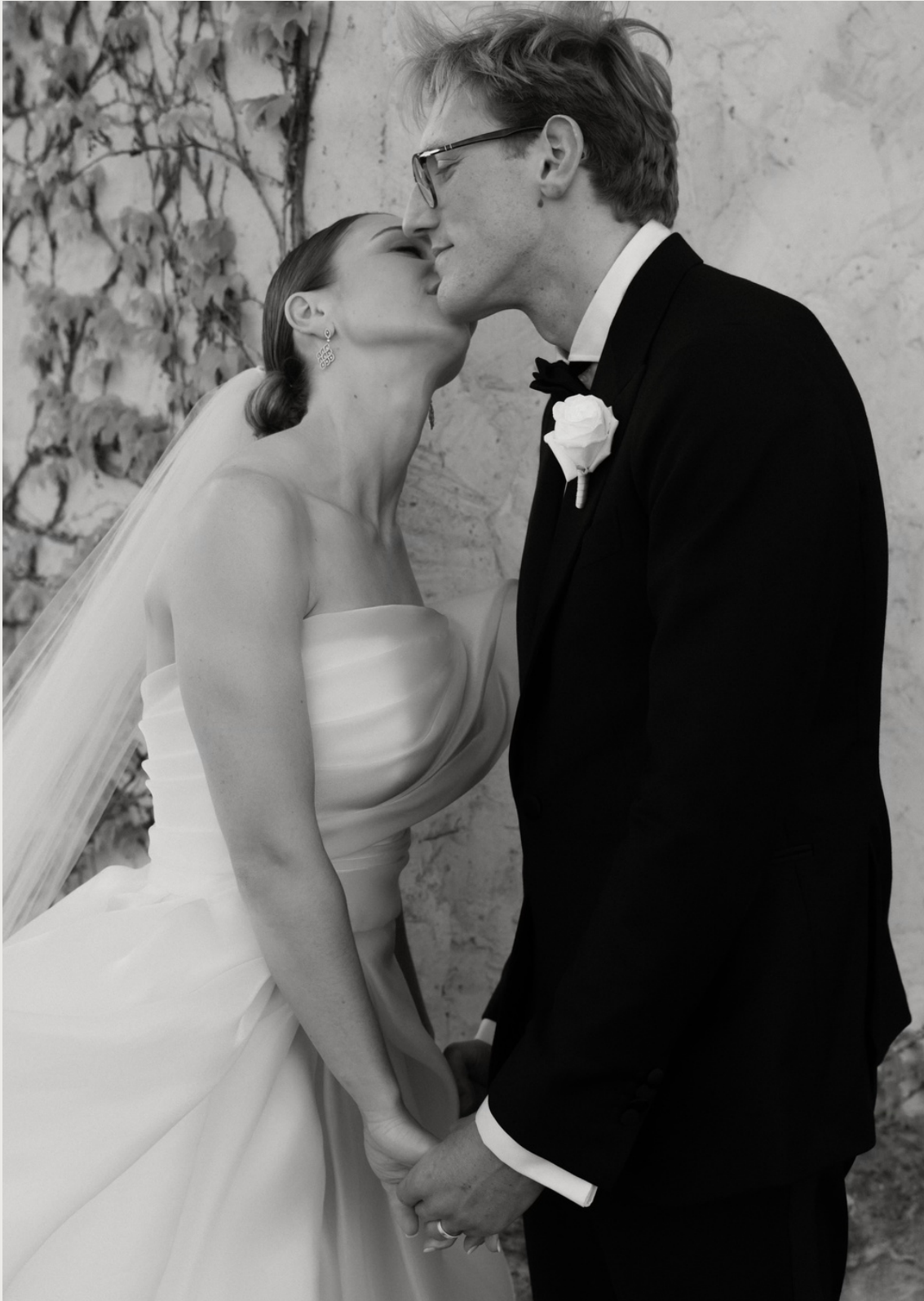
ELLA & MACK HORTON OLYMPIC GOLD MEDALIST